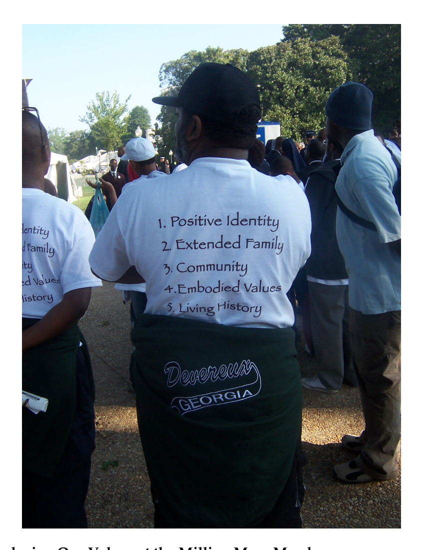
Figure 30: Displaying Our Values at the Million More March

Additionally, we informed that on return the young people would present and give evidence of their learning experiences not only in writing and pictures, but in dialogue with peers, parents and professionals who make impact on their lives.