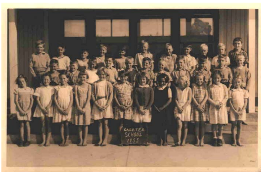
School photo, 1955

The normality of my bare feet came into my thoughts because of a work incident a few years ago. A family under surveillance for neglect kept their immunisation appointment but the children had walked to us barefoot in the streets. Practice staff were concerned that this was a sign of neglect, but bare feet held little significance for me. Although the children were dirty, I saw them as robust, cheerful and showing usual milestones of development. I knew their mother to be warm and responsive towards them. I recalled visiting a homeless hostel where I was astonished by the social skills of the three-year-old as he helped another child climb over upturned chairs. He held her hand and gave verbal encouragement.