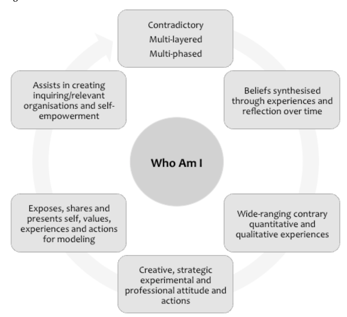
Figure 49: Who Am I?

However, even at that time a thought was emerging, which I expressed as follows: