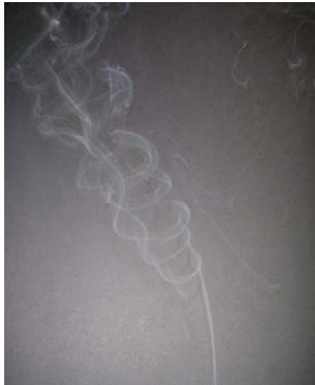
Path of vortices created by smoke as it slows down and meets water molecules in the air.