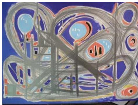
Title 5hrs 10 minutes