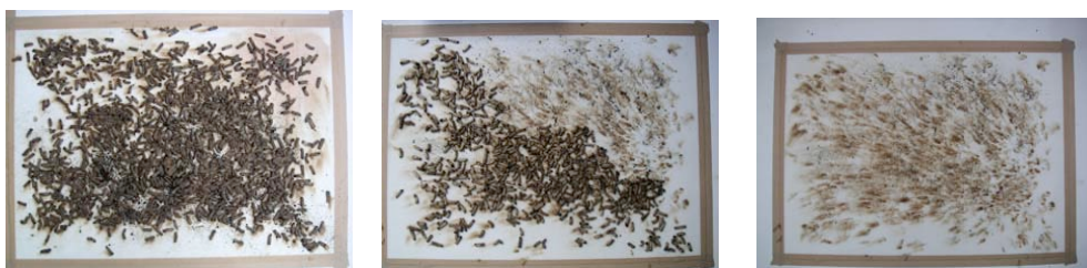
Examples of making process in the production of drawings and prints

To do this I kept a daily document of the consumption of cigarettes. Daily collections of all the cigarettes I smoked provided a documentary record and a collection of materials. These were then used in different ways over 18 months. The materials were then used in the production of art works. Thoughts were captured through the making process itself as a form of meaning in the making.