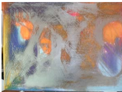
Title 5 hrs 40 minutes